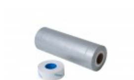
WHITE DOUBLE LINE PRICING TICKETS