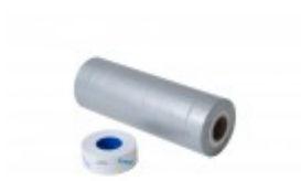
BEST BEFORE BILINGUAL SINGLE LINE PRICING TICKETS