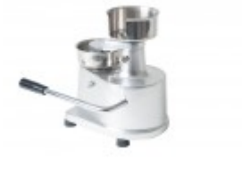
HAMBURGER PATTY MOLD MACHINE 4-5 patties per pound