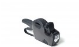
PRICING GUN (SINGLE LINE)