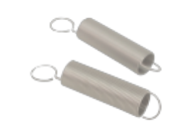
Spring for SPH cheese cutter Sold by pair