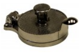
HAMBURGER PRESS, ADJUSTABLE