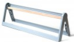
24" STANDARD PAPER CUTTER