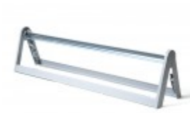
STANDARD FILM CUTTER, 30"