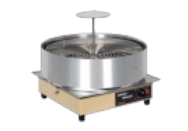
Wisco pizza wrapper