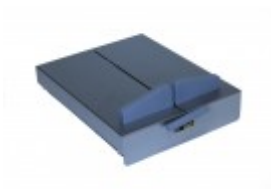
Stainless Steel Cheese Cutter