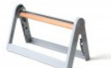
12" STANDARD PAPER CUTTER