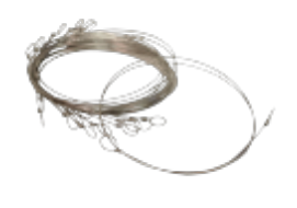
24" wire for SPH cheese cutter 12 per pack