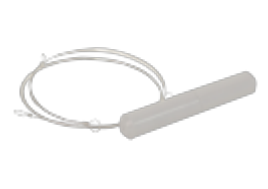
Cheese wire 2 handles, package of 2