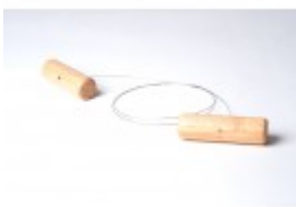
Metal cheese wire