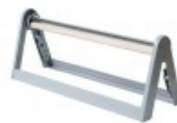
18" STANDARD PAPER CUTTER