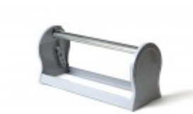
DELUXE FILM CUTTER 15"