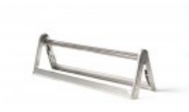
S/S 18" MODEL PAPER CUTTER