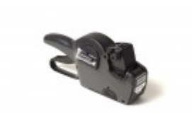
PRICING GUN (DOUBLE LINE)