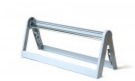
STANDARD FILM CUTTER 18"