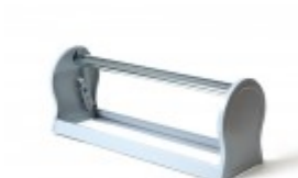
DELUXE FILM CUTTER, 18"