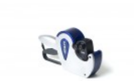
DOUBLE LINE PRICING GUN "OPEN CODE"