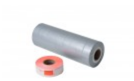
RED "SPECIAL" SINGLE LINE PRICING TICKETS