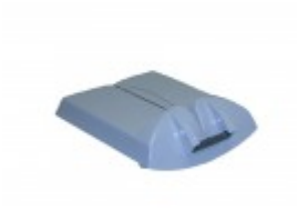
Plastic Cheese Cutter