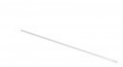
FILM GUIDE ROD FOR 625A BANDER