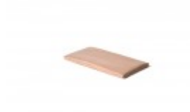
Teflon cover 6" x 14"