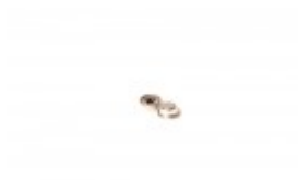
FILM GUIDE CAP FOR BANDER