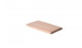
Teflon cover 6" x 12"