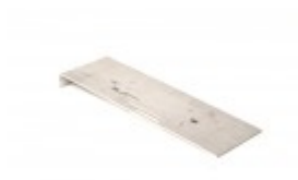
PLATE RETAINING ELEMENT