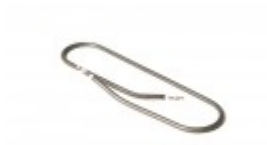
HOT PLATE ELEMENT