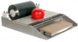
Heat Seal Single Roll Film Wrapper

Dimensions 26" D x 22"W x 9" H 115 volt, 6.5 amp, 60 cycles 20 watts 19 lbs. Use 6" x 15" teflon hot plate cover