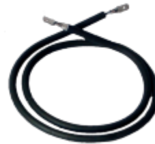
Spiral shaped element for TT69