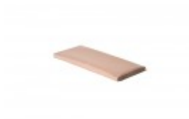
Teflon cover 6" x 15"