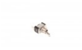
ON/OFF TOGGLE SWITCH FOR BANDER