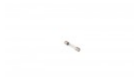
FUSE FOR BANDER