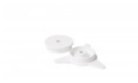
FILM CORE FOR BANDER Sold by pair