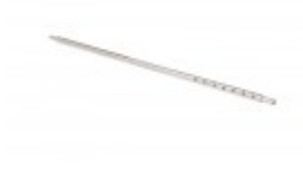
FILM AXLE FOR BANDER 28"