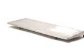
10"X30" HOT PLATE