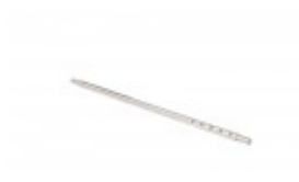
FILM AXLE FOR BANDER 22"