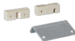
RETROFIT KIT FOR BANDER