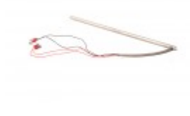
HOT ROD FOR MINI BANDER 15"