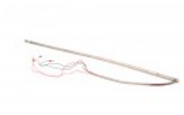
Hot rod for bander 23"