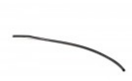
VINYL COVER FOR FILM GUIDE ROD FOR 625A BANDER