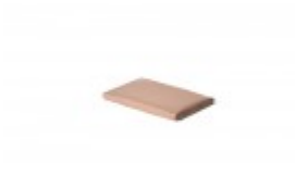
Teflon cover 6" x 9"