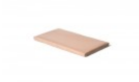
Teflon cover 8" x 15"