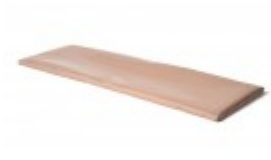
Teflon cover 10" x 30"