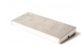
HOT PLATE 6"X15", NO ELEMENT