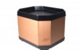
40"X48" set includes top, base and box OCT, OCT-PB, OCT-BOX