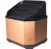
40"X48" set includes top, base and box OCTBANANE-H, OCTPB, OCT-BOX