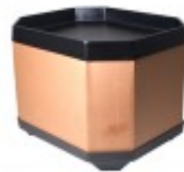
40"X48" set includes top, base and box OCT, OCT-PB, OCT-BOX