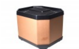
40"X48" set includes top, base and box OCTCOMBO, OCTPB, OCT-BOX