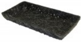
California Tray 12"X24"X3"