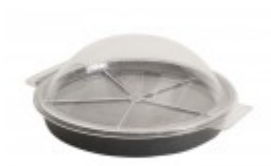
16" DIA. COUNTER TOP SAMPLE DOME