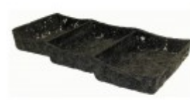
California Tray 15"x37"x3"