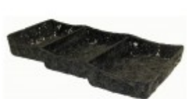
California Tray 15"x37"x3"