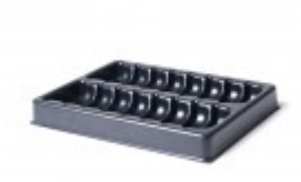
HERB TRAY DOUBLE WITH LIP BLACK 10"X12"X1.5"