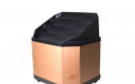
40"X48" set includes top, base and box OCTBANANE-H, OCTPB, OCT-BOX