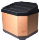
40"X48" set includes top, base and box OCTBANANE, OCTPB, OCT-BOX