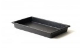
BLACK PLASTIC TRAY 11.75"X17.25"X2.25" HIGH