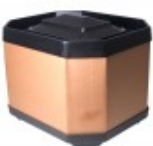
40"X48" set includes top, base and box OCTCOMBO-SHORT, OCTPB, OCT-BOX