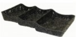
California Tray 15"x35"x5"