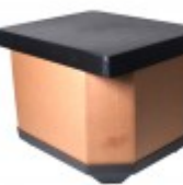
40"X48" set includes top, base and box OCT-FLAT, OCTPB, OCT-BOX