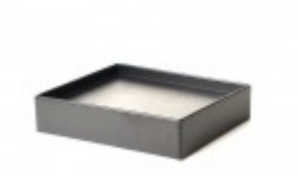
TWO SIDED TRAY 11,5"X13.5"