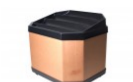
40"X48" set includes top, base and box OCTBANANE, OCTPB, OCT-BOX