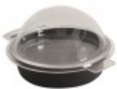
9" DIA. COUNTER TOP SAMPLE DOME