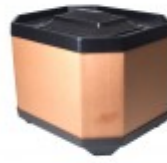
40"X48" set includes top, base and box OCTCOMBO, OCTPB, OCT-BOX