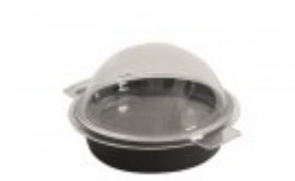
9" DIA. COUNTER TOP SAMPLE DOME