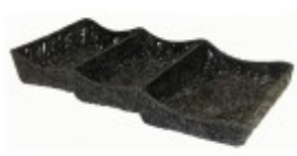
California Tray 15"x35"x5"