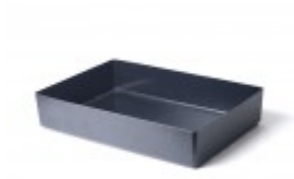
PLASTIC TRAY, BLACK 12"X16"X2.5" C/W 1/8" DIAMETER HOLES