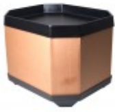
40"X48" set includes top, base and box OCT, OCT-PB, OCT-BOX