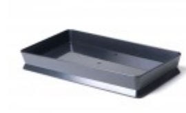
DBL SIDED PLASTIC BASKET BLACK 11.5"X 14.5"X2"