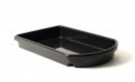
CURVED FRONT BASKETS 16X19X2.5