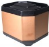
40"X48" set includes top, base and box OCTCOMBO-SHORT, OCTPB, OCT-BOX