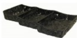
California Tray 15"x37"x3"