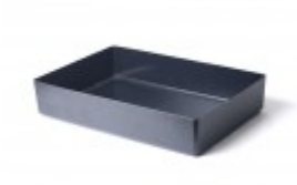
PLASTIC TRAY, BLACK 12"X16"X2.5" C/W 1/8" DIAMETER HOLES