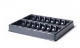
HERB TRAY DOUBLE WITH LIP BLACK 10"X12"X1.5"