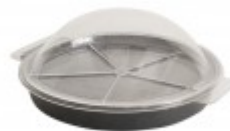
16" DIA. COUNTER TOP SAMPLE DOME