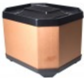
40"X48" set includes top, base and box OCTCOMBO, OCTPB, OCT-BOX