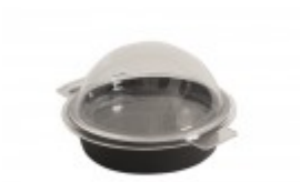
9" DIA. COUNTER TOP SAMPLE DOME