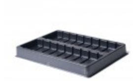
HERB TRAY DOUBLE WITH LIP PURPLE 10"X12"X1.5"