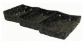
California Tray 15"x37"x3"