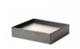
TWO SIDED TRAY 11,5"X13.5"