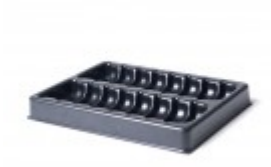
HERB TRAY DOUBLE WITH LIP BLACK 10"X12"X1.5"