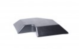
BLACK PLASTIC DUMMY WITH 45° ANGLE 22.5"X15"X3"H