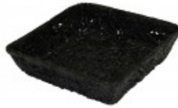
California Tray 12"X"12"X3"