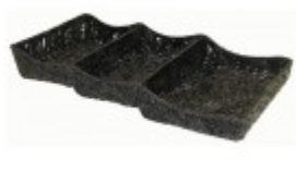
California Tray 15"x35"x5"