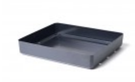
PLASTIC TRAY, BLACK 12"X14"X2.5" C/W 1/8" DIAMETER HOLES