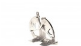
Stainless steel mouse trap honing tool