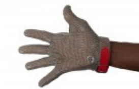
Safety glove Universal small