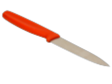
4" paring knife