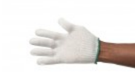
Sem Xcut handguard safety glove Extra small