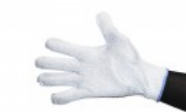
Sem Xcut handguard safety glove Large