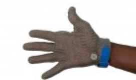
Safety glove Universal large