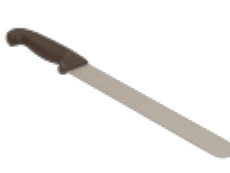
Slicing knife, 10" blade