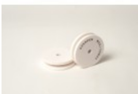
Sharpening wheel for edge professional sharpener