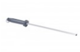
12" Diamond Finish Sharpening steel