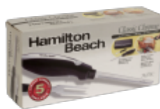
Hamilton Beach electric knife