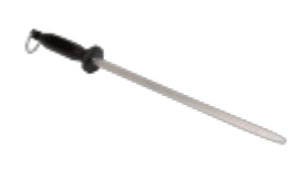
14" Magnetized butcher steel