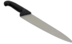
14" slicer knife, straight edge, plastic handle