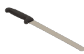
Serrated bread knife, 10" blade