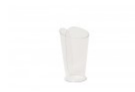
PLASTIC ARM GUARD Extra extra large, 7.5" long, clear