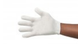
Sem Xcut handguard safety glove Small