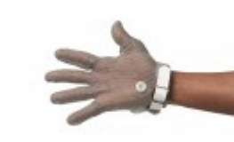
Safety glove Universal medium