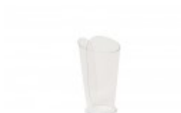
PLASTIC ARM GUARD Extra large, 7.5" long, clear