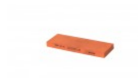
Simpson sharpening stone