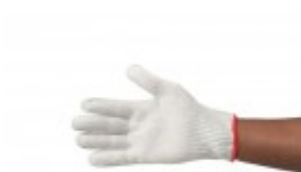
Sem Xcut handguard safety glove Medium