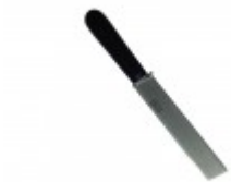
Produce Trim Knife 6"