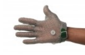
Safety glove Universal extra small