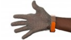
Safety glove Universal extra large