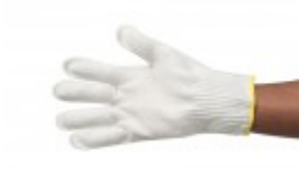
Sem Xcut handguard safety glove Extra large