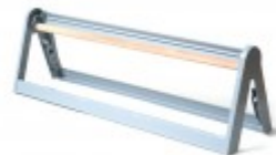
24" STANDARD PAPER CUTTER