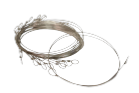
24" wire for SPH cheese cutter