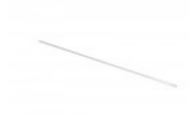
FILM GUIDE ROD FOR 625A BANDER