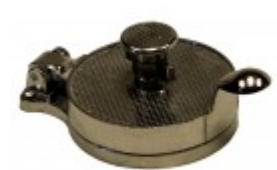
HAMBURGER PRESS, ADJUSTABLE