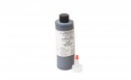
INK FOR RDL SPEED PRICER BLACK