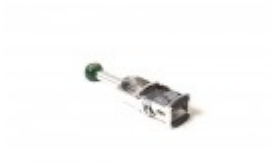
NO LETTERS - GARVEY KING SIZE PRICE MARKER