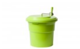
MANUAL SALAD SPINNER, 20 LITRES