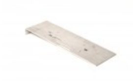
PLATE RETAINING ELEMENT