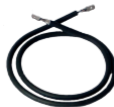
Spiral shaped element for TT69