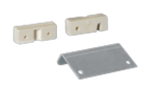
RETROFIT KIT FOR BANDER