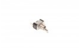
ON/OFF TOGGLE SWITCH FOR BANDER