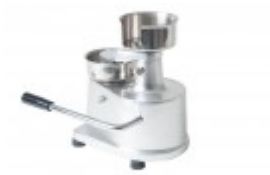
HAMBURGER PATTY MOLD MACHINE