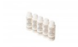
4OZ INK REMOVER FOR RDL SPD PRICER