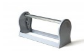
DELUXE FILM CUTTER 15"