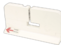
Novem tape dispenser bag closure