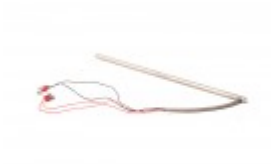
HOT ROD FOR MINI BANDER 15"