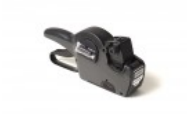
PRICING GUN (DOUBLE LINE)