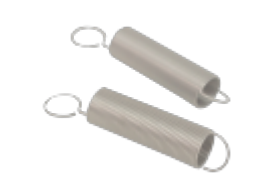
Spring for SPH cheese cutter