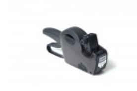
PRICING GUN (SINGLE LINE)