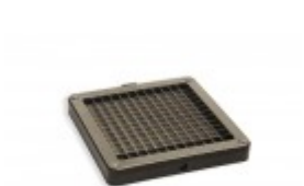
1/4" X 1/4" DICER BLADE ASSEMBLY