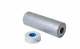
WHITE DOUBLE LINE PRICING TICKETS