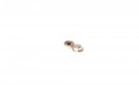
FILM GUIDE CAP FOR BANDER