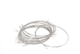
36" wires for cheese cutter