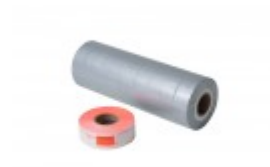
RED "SPECIAL" SINGLE LINE PRICING TICKETS