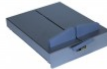
Stainless Steel Cheese Cutter