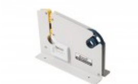
POLY BAG SEALER, STEEL POWDER COATED GREY