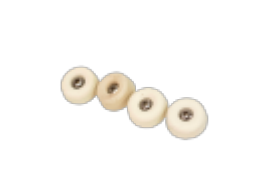
Rubber foot for SPH cheese cutter