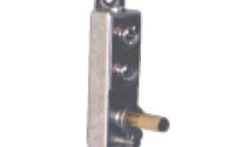
Thermostat for Bander/KWIK-SEAL