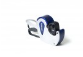
DOUBLE LINE PRICING GUN "OPEN CODE"