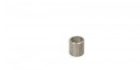
ALUMINUM STOP FOR VEGETABLE DICER