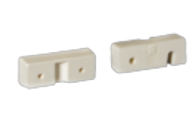
BRAKE BLOCK FOR BANDER Sold by pair