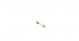
FUSE FOR BANDER