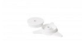
FILM CORE FOR BANDER