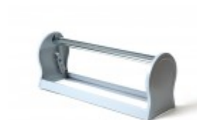
DELUXE FILM CUTTER, 18"