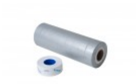
BEST BEFORE BILINGUAL SINGLE LINE PRICING TICKETS