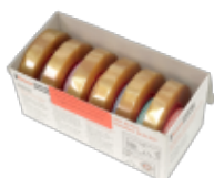
Refills for novem tape dispenser Box of 6