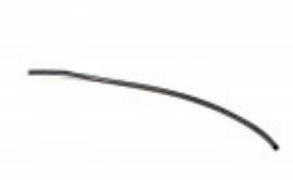
VINYL COVER FOR FILM GUIDE ROD FOR 625A BANDER