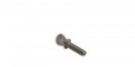
THUMB SCREW FOR VEGETABLE DICER