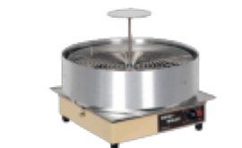
Wisco pizza wrapper