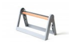
12" STANDARD PAPER CUTTER