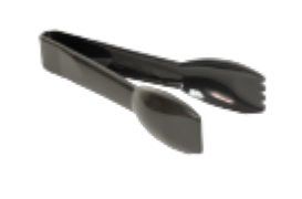
Black acrylic tong 9"