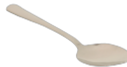
Tablespoon Set of 12