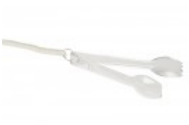
TONG & TETHER KIT