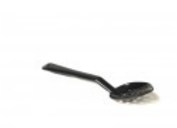
BLACK POLYCARBONATE PERFORATED SPOON 11"