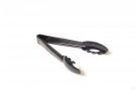
Black acrylic tong 6"