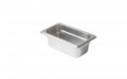
Stainless steel salad pan