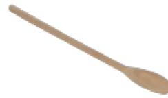
Wooden Spoon 18"