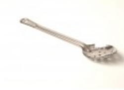
STAINLESS STEEL PERFORATED SPOON 11"