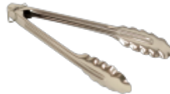
Stainless steel pastry tong 9"