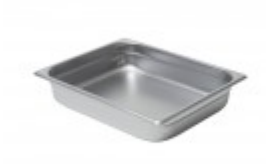
STAINLESS STEEL SALAD PAN