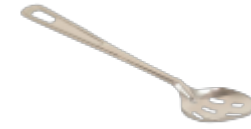
Slotted stainless steel spoon 15"