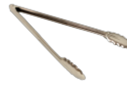
Stainless steel pastry tong 16"