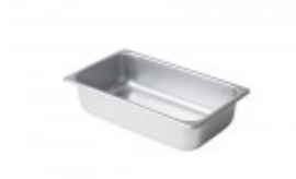
STAINLESS STEEL SALAD PAN 1/4 size pan 10" L x 6" W x 2.5" H