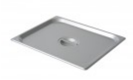
Stainless steel cover for 1/2 size stainless steel pan 10"X12"