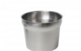
Bain marie insert