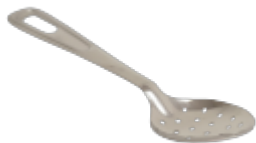
STAINLESS STEEL PERFORATED SPOON 13"