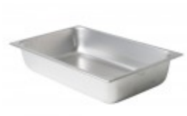
Steam table pan