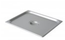
Stainless steel cover for 1/2 size stainless steel pan