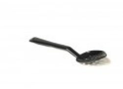
BLACK POLYCARBONATE PERFORATED SPOON 11"