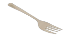
Salad fork Set of 12