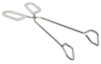
Scissor tong with insulated handle 12"