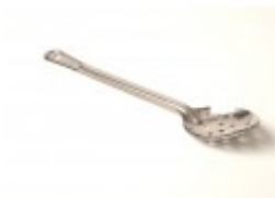
STAINLESS STEEL PERFORATED SPOON 11"