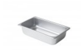
STAINLESS STEEL SALAD PAN