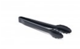
Black plastic tong