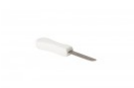
OYSTER SHUCKER KNIFE