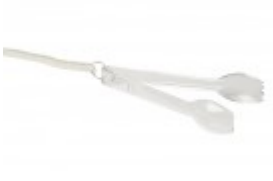
TONG & TETHER KIT