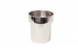
Bain marie insert