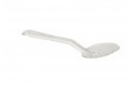
Clear polycarbonate perforated spoon 11"