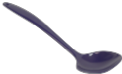
Blue solid plastic spoon 12"