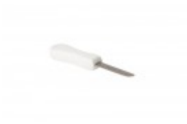
OYSTER SHUCKER KNIFE