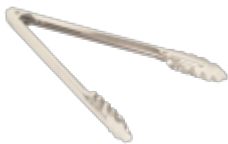
Heavy duty tong 12"