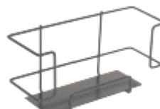
Disposable glove box holder Wall mount