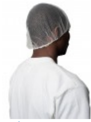
Hair net White, 21", 1/8" hole, nylon honeycomb style (100 per pack)