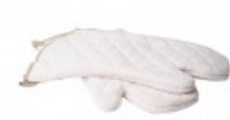
CLOTH OVEN MITTS 17"