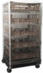
CLEAR COVER FOR CRISPING CART 30"x34"X62", 4 zippers