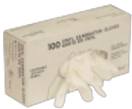
Medium disposable vinyl gloves 100 per box