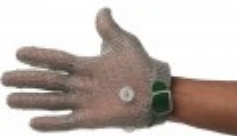
Safety glove Universal extra small