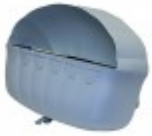
INSECT INN ULTRA BUG & FLY KILLER