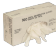
Small disposable vinyl gloves 100 per box