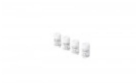
STARTER #FS-22 FOR BULB IN