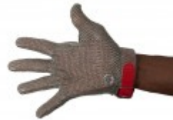
Safety glove Universal small