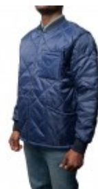
Quilted freezer jacket Large, blue