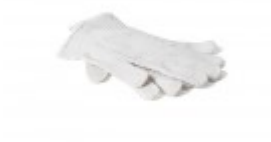
REVERSIBLE KNIT COTTON GLOVES Dozen pairs/pack