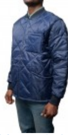
Quilted freezer jacket Small, blue