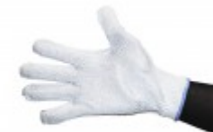
Sem Xcut handguard safety glove Large