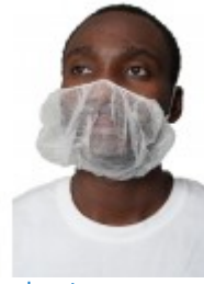
Beard net Bag of 100