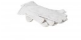
REVERSIBLE KNIT COTTON GLOVES Dozen pairs/pack