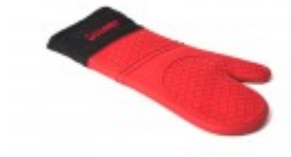
SILICONE OVEN MITT 15"