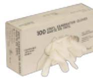
Large disposable vinyl gloves 100 per box