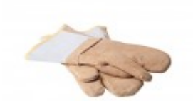
LEATHER OVEN MITTS Sold by pair