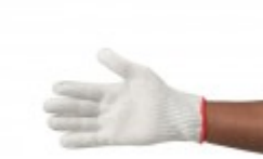
Sem Xcut handguard safety glove Medium