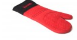
SILICONE OVEN MITT 15"