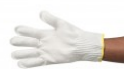
Sem Xcut handguard safety glove Extra large