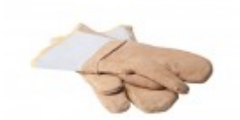
LEATHER OVEN MITTS Sold by pair