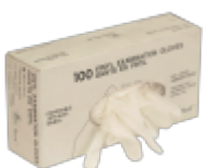
Extra small disposable vinyl gloves 100 per box