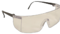
Safety Glasses Clear plastic safety glasses, black arms. One size.