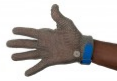
Safety glove Universal large