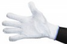
Sem Xcut handguard safety glove Large