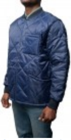
Quilted freezer jacket Medium, blue