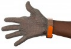
Safety glove Universal extra large