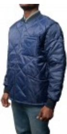
Quilted freezer jacket Extra large, blue