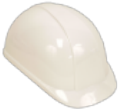
White Safety bump cap